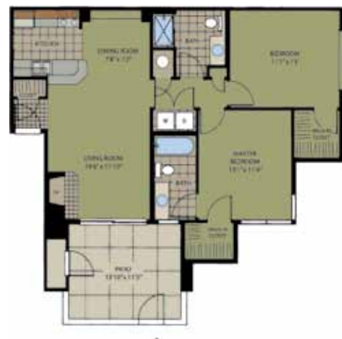
LYNWOOD • 960 Sq. Ft. Two Bedroom / Two Bath