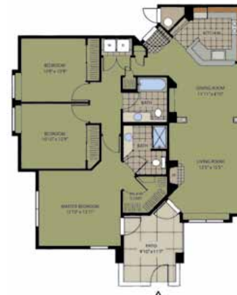
OCOTILLO • 1,289 Sq. Ft. Three Bedroom / Two Bath