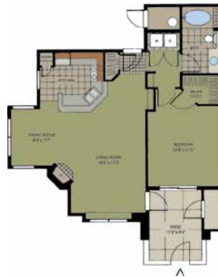
CHOLLA • 815 Sq. Ft. One Bedroom / One Bath