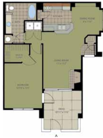
AGAVE • 745 Sq. Ft. One Bedroom / One Bath