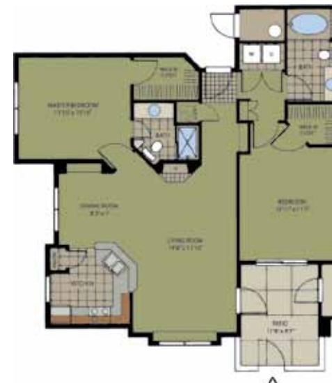
SAHAURO • 1,080 Sq. Ft. Two Bedroom / Two Bath