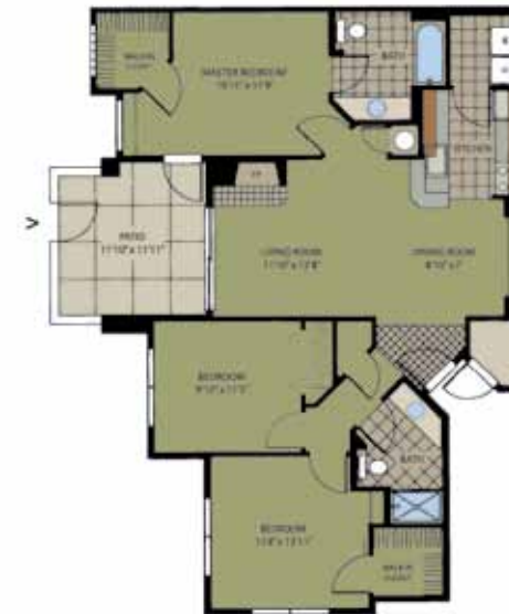
MANZANITA • 1,170 Sq. Ft. Three Bedroom / Two Bath