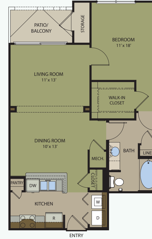
MANZANO • 792 Sq. Ft. 1 Bedroom / 1 Bath