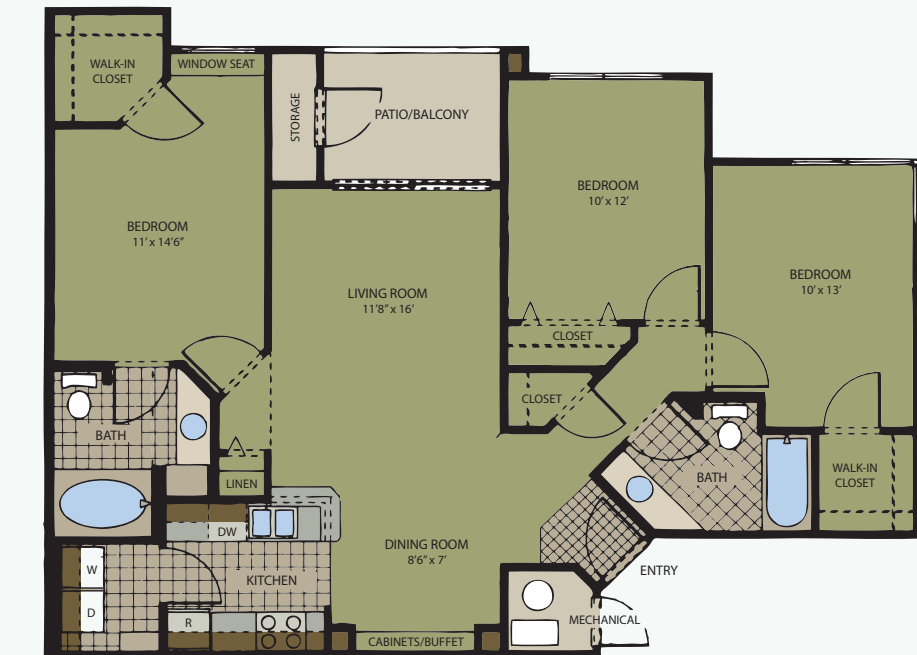
COTTONWOOD • 1,110 Sq. Ft. 3 Bedroom / 2 Bath