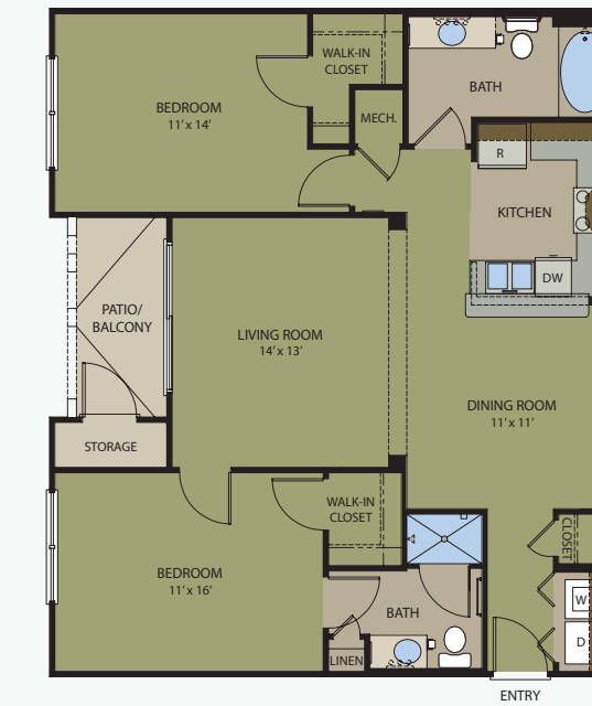
SANDIA • 1,099 Sq. Ft. 2 Bedroom / 2 Bath