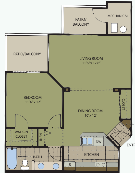
TAOS • 732 Sq. Ft. 1 Bedroom / 1 Bath