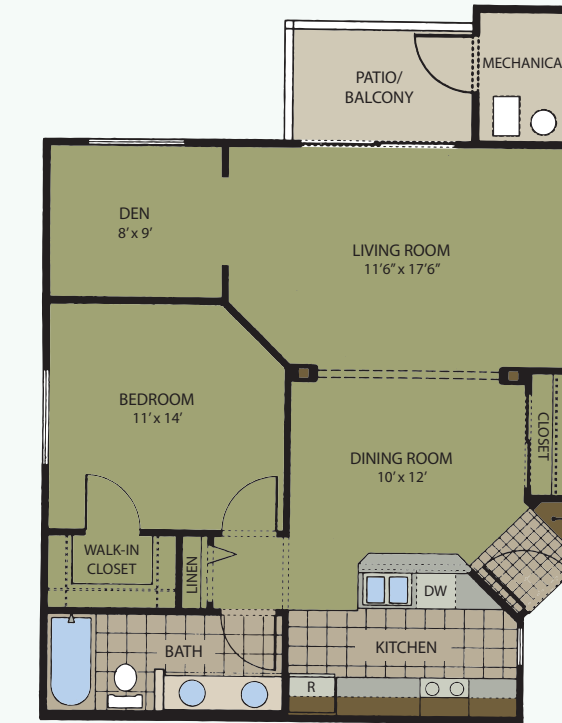
MESA/YUMA • 802 Sq. Ft. 1 Bedroom / 1 Bath + Study