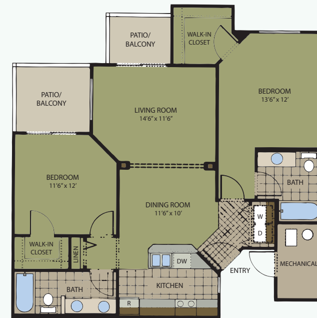
PUEBLO • 1,023 Sq. Ft. 2 Bedroom / 2 Bath