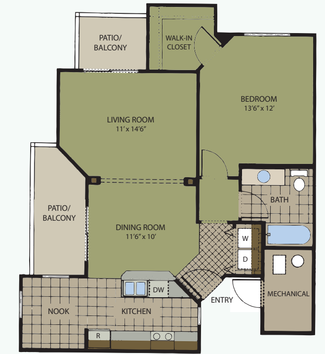
SANTA FE • 817 Sq. Ft. 1 Bedroom / 1 Bath