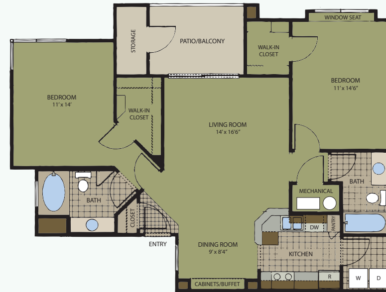
MAPLE • 1,075 Sq. Ft. 2 Bedroom / 2 Bath