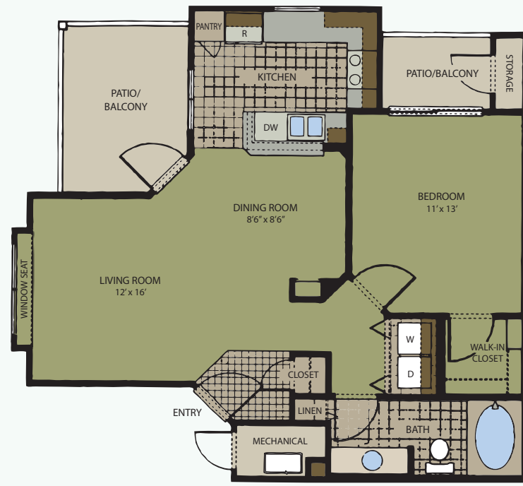
ASPEN • 726 Sq. Ft. 1 Bedroom / 1 Bath