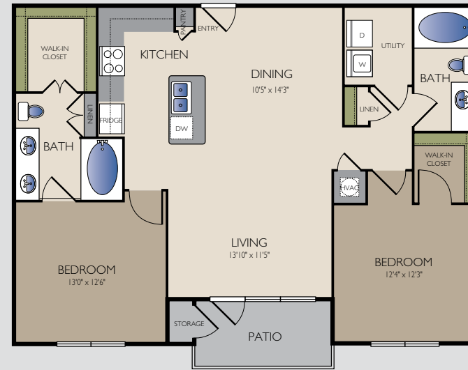
THE RUTLAND Two bedroom / Two bath 1,145 sq ft