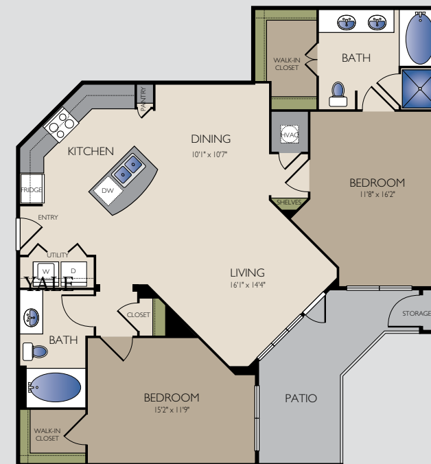
THE HEIGHTS Two bedroom / Two bath 1,198 sq ft