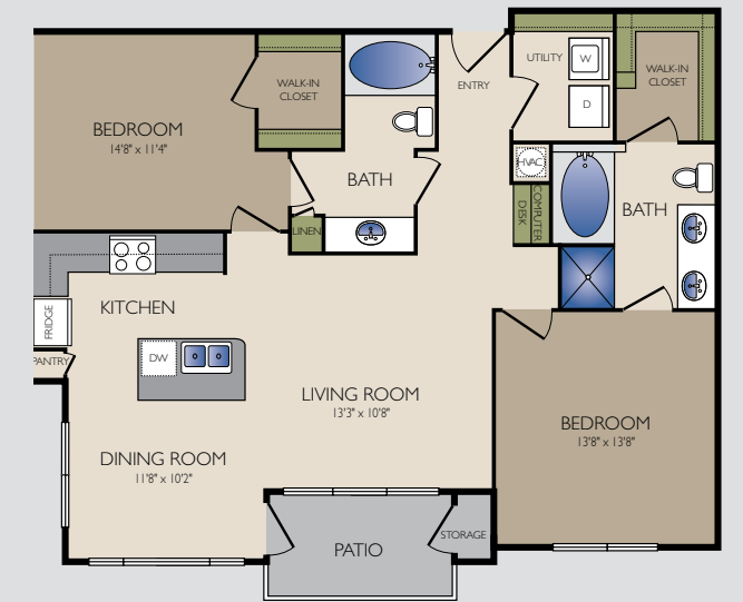
THE ASHLAND Two bedroom / Two bath 1,165 sq ft