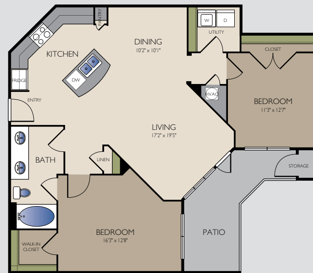
THE YALE Two bedroom / One bath 1,087 sq ft