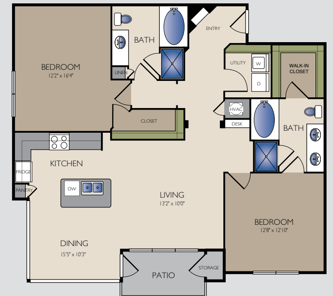
THE KAPLAN Two bedroom / Two bath 1,304 sq ft