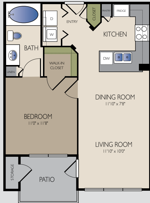
THE STUDEWOOD One bedroom / One bath 627 sq ft