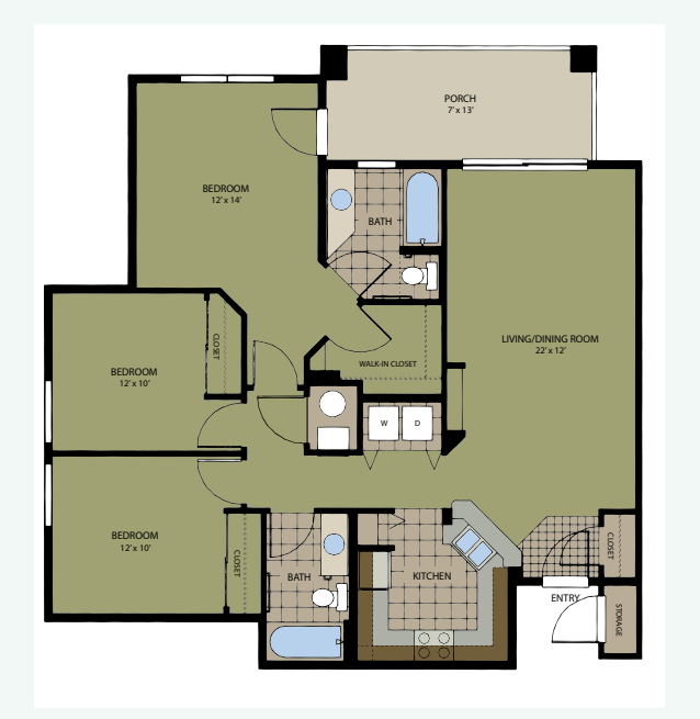
THE THREE BEDROOM • 1,171 Sq. Ft. Three Bedroom / Two Bath