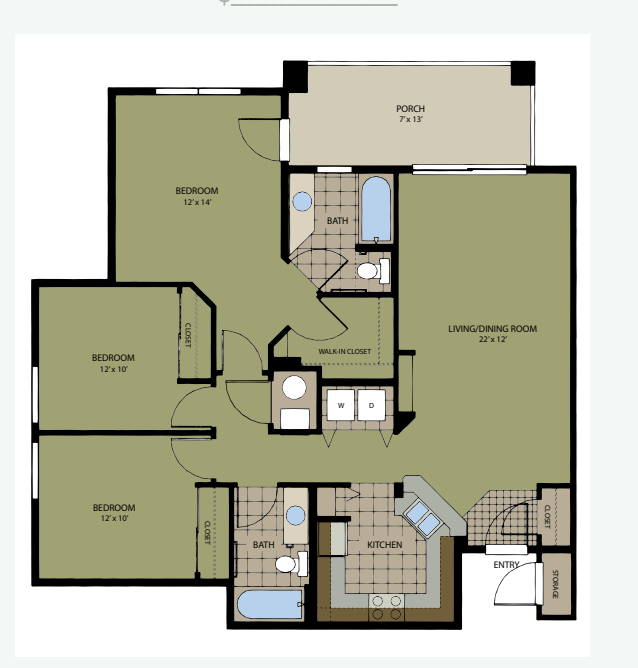
THE THREE BEDROOM • 1,171 Sq. Ft. Three Bedroom / Two Bath $_____