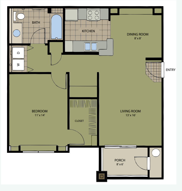
THE ONE BEDROOM • 773 Sq. Ft. One Bedroom / One Bath