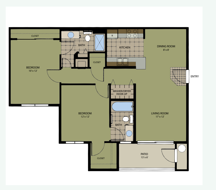
THE TWO BEDROOM • 949 Sq. Ft. Two Bedroom / Two Bath