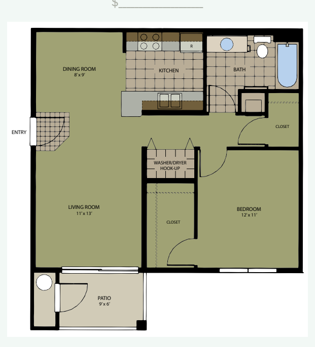
THE ONE BEDROOM • 749 Sq. Ft. One Bedroom / One Bath