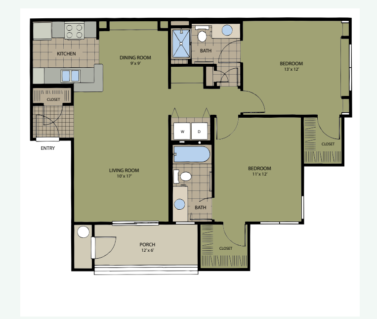
THE TWO BEDROOM • 1,008 Sq. Ft. Two Bedroom / Two Bath