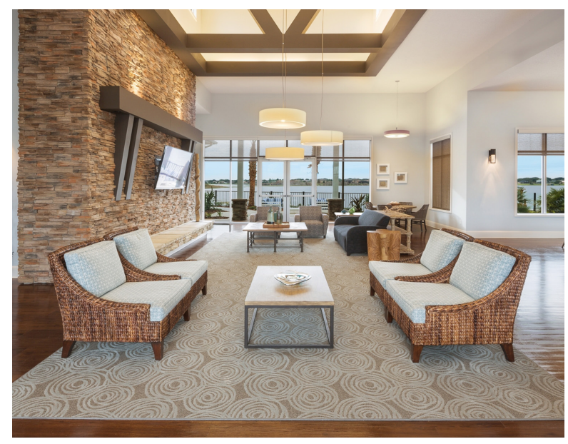
*Subject to change, error, and/or deletion.