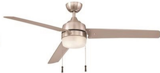
Ceiling Fans in Bedrooms

*Images shown are for representation purposes only and may vary upon actual construction. 4/22