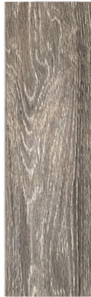
Vinyl Plank Flooring