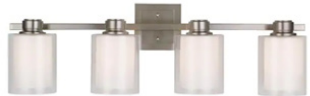
Bathroom Vanity Light