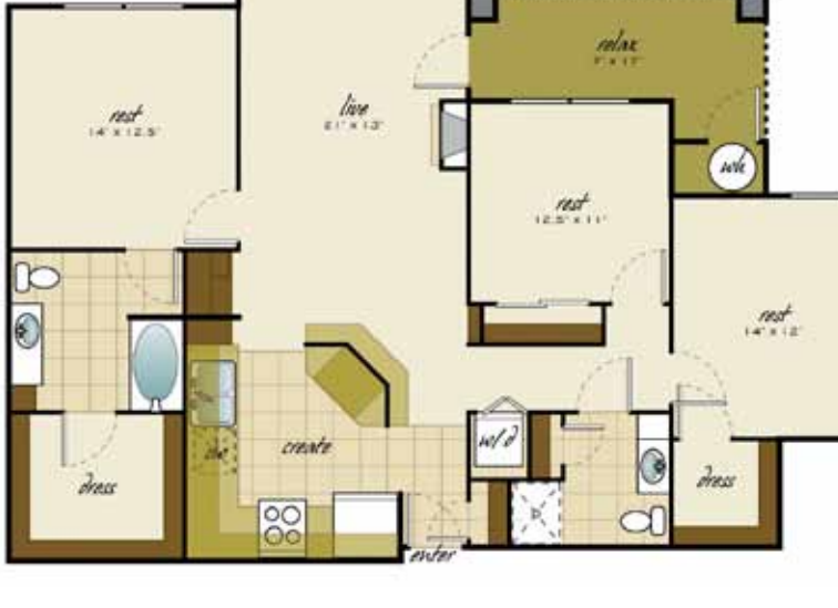
TALLGRASS • 1,170 Sq. Ft. 2 Bedroom / 2 Bath + Study